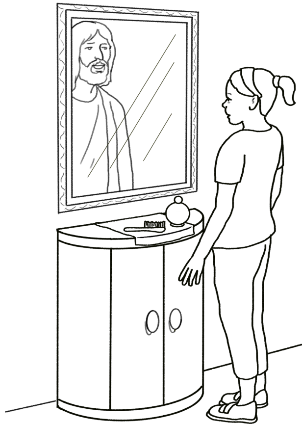
Being like Jesus is how we can see God in ourselves.

Jesus explains that all are welcome to join him in doing good and being kind to others.